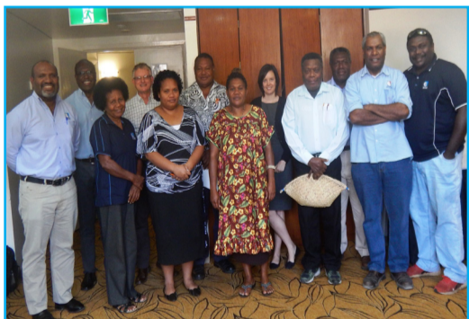
Participants at the Strategic Planning Workshop

Government attendees thanked Nautilus for inviting them to be involved in the development of the Strategic Plan. Working together from the beginning will ensure alignment and allow all partners to allocate resources effectively. One government representative stated that Nautilus should be commended for facilitating the meeting and being transparent, no other company in their province has placed the same level of importance on building a positive partnership.